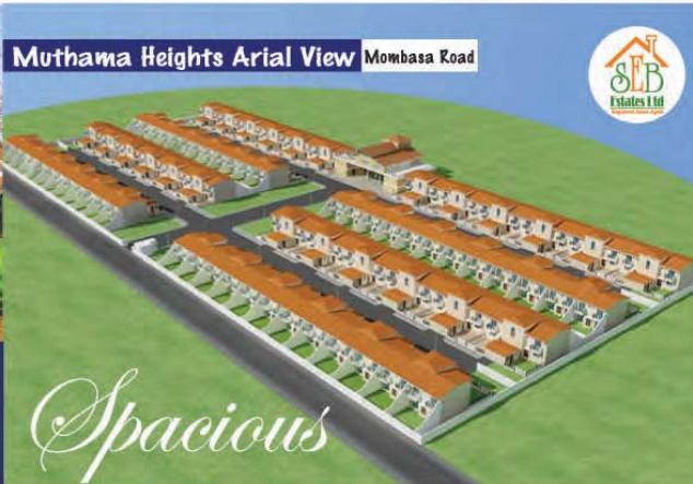
Muthama Heights Aerial View Mombasa Road