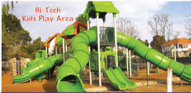
Hi-Tech Kids Play Area