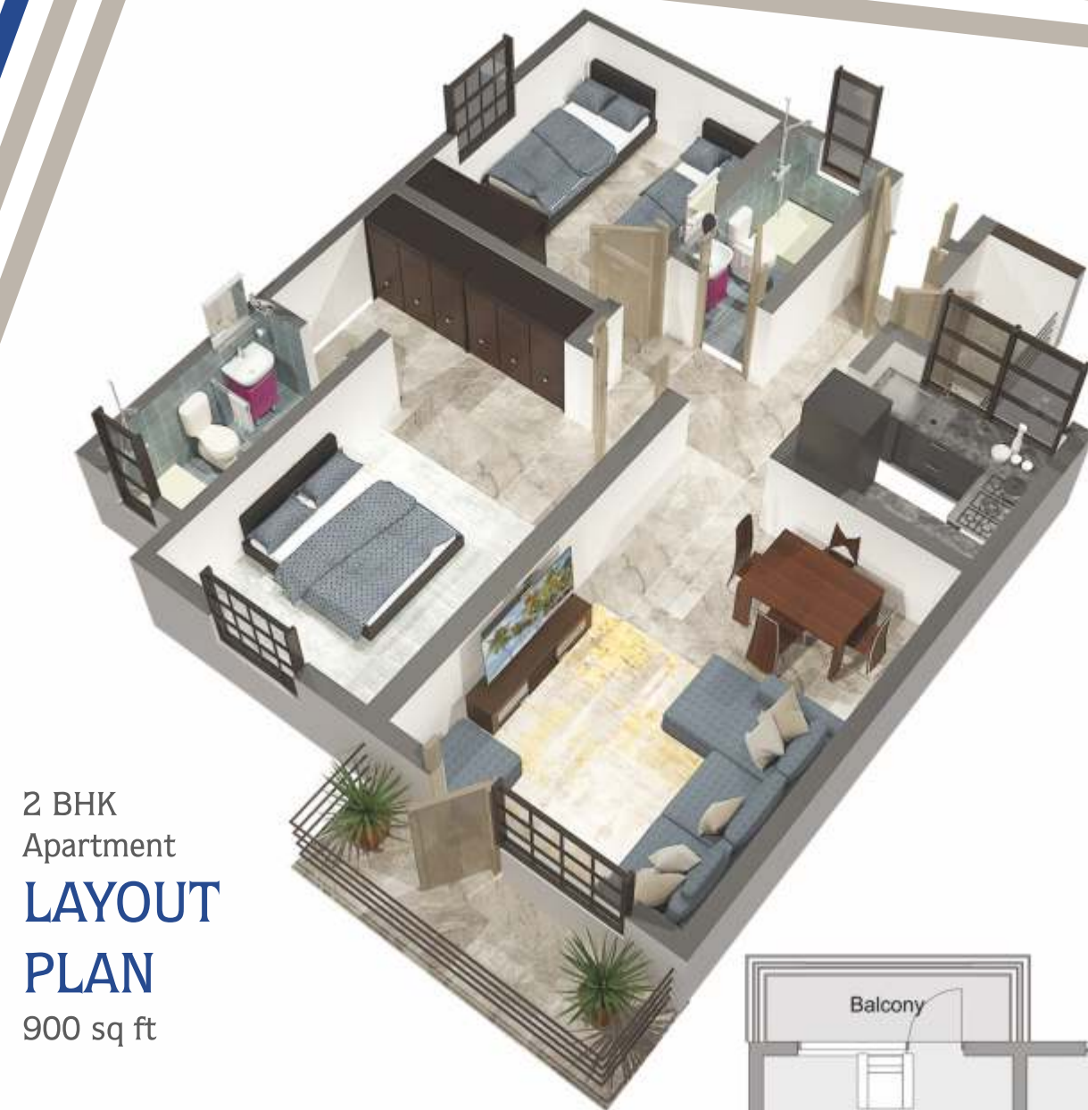
2 BHK Apartment LAYOUT PLAN 900 sq ft